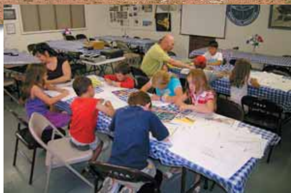
The coloring contest What concentration