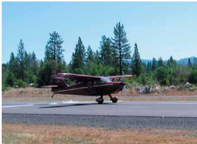
Logan Boles wins the spot landing contest

After the bombs are dropped, contestants go for a spot