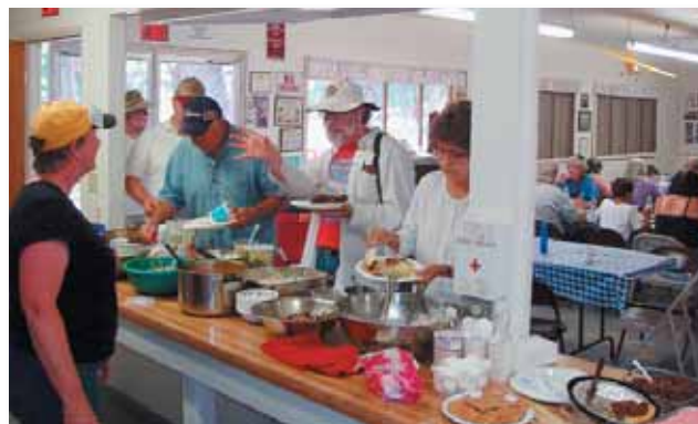
Plenty of good food