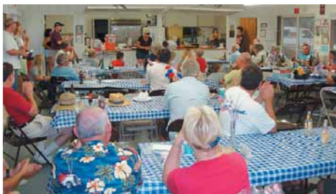
Old friends and new gather for an evening of fun and fellowship