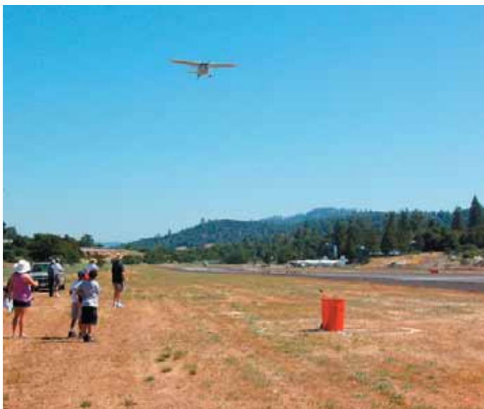
A flour bomb run

Saturday afternoon is time for the kid's games and there was a lot of enthusiastic participation. Coloring, paper airplane design and flight contests and stomp rocket contests for height