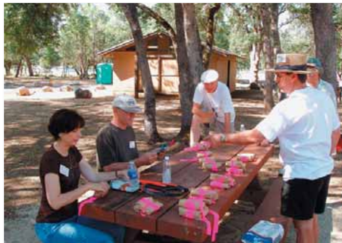
Bomb makers Not the wild-eyed radicals you might expect