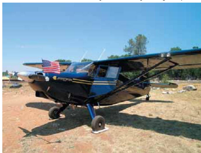
Best Stinson Columbia '06